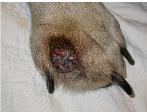
Figure: a mass such as this foot lesion needs a biopsy to determine whether it is neoplastic, or inflammatory

This is a test to obtain samples of either cells or tissue to determine whether the mass is infectious, inflammatory or a neoplasm *, and if a neoplasm, if it is benign * or malignant *. The sample might be taken by a fine needle aspirate *, a core biopsy, or even a mini surgical procedure to take a small wedge of the mass.