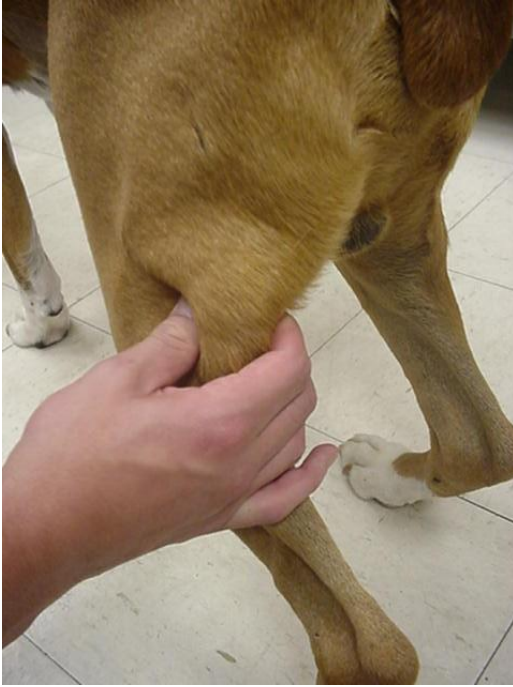
Figure: The lymph node immediately behind the knee is being examined. This lymph node (popliteal) drains all tissues below the knee.