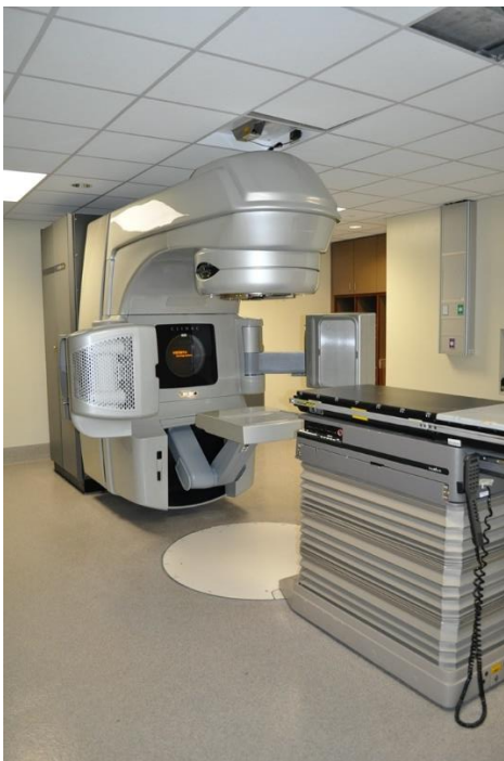
Figure: A radiation machine called a linear accelerator which delivers radiotherapy.

This is the process of treating cancers* with high doses of radiation to kill the cancer cells where they are. They subsequently die over several weeks and months and the cancer starts to shrink. Sometimes RT is given before surgery* to make the mass smaller ahead of time. Sometimes however the surgery is performed first, and RT given to the surgical scar if the veterinarian is worried that cancer cells might be left behind. Patients need to be anaesthetised to receive radiotherapy and often multiple doses are given over many days. Due to the expense and logistics of treatment, radiation facilities for animal use may not be available in your region.