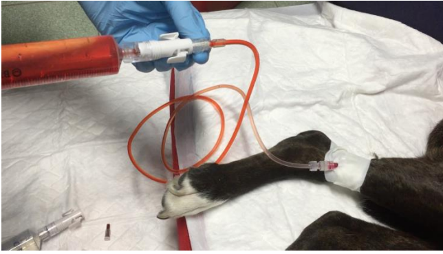
Figure: closed administration systems are mandatory in some countries for chemotherapy administration