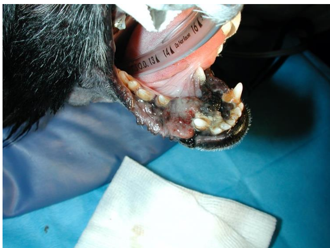
Figure: the grey/black fleshy area at the front of the dog's jaw is oral melanoma. This can commonly metastasise to the regional lymph nodes* in the neck which should be examined, and sampled with a fine needle aspirate* .

The action of cancer* cells leaving the original mass, travelling in the blood stream or lymphatic fluid, settling out in a tissue away from the primary mass, and starting to divide and grow. Certain tumors tend to metastasise to certain areas, e.g. bone cancer preferentially metastasises to the lungs ( distant metastasis* ), and melanoma in the mouth usually spreads to local lymph nodes* at the angle of the jaw first ( regional metastasis* ).