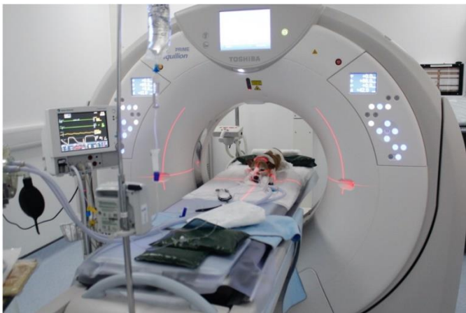
Figure: a dog undergoing a CT scan. He is anaesthetised to be motionless for the study.

Advanced imaging tools used in human medicine that are now increasingly been seen in veterinary medicine. These are 'doughnut' shaped devices that the patient passed through and either radiation (CT) or magnetic fields (MRI) allow the internal tissues and organs to be accurately seen, reconstructed into thin slices (1 mm sometimes) to give a very accurate 3D understanding of where the cancer* is in the tissues, if it is affecting or invading nearby vital structures, and whether there is any evidence of regional metastasis* or distant metastasis* . A radionuclide scan uses small amounts of radioactive material (often injected in a vein) that selectively attaches to places of interest (tumors or organs). The radioactivity is then measured using a specific scanning machine.