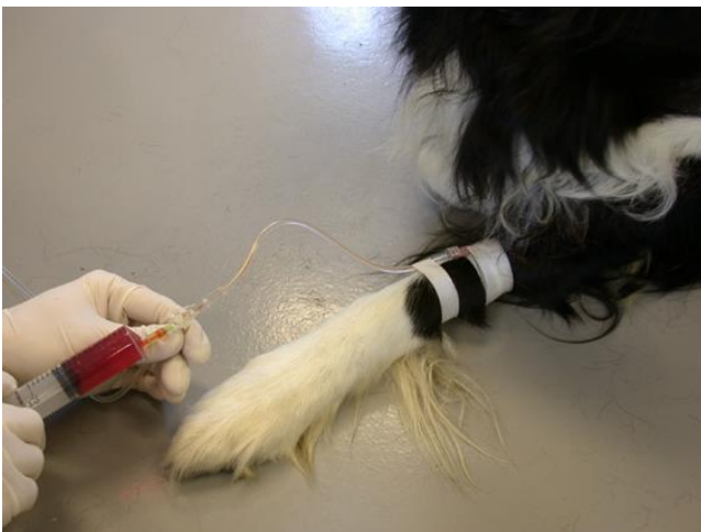
Figure: a dog receiving chemotherapy through a catheter into a vein in the front leg

Cancer* cells are rapidly dividing and chemotherapy is the use of drugs that damage and kill rapidly dividing cells. The drugs are sometimes given orally, but many are given intravenously, typically every few weeks. The same chemotherapy drugs given to human patients are also given to veterinary patients, but lower doses are used to minimise side-effects, yet still hopefully slow the cancer down, and improve overall median survival time* . Side-effects that might be seen include vomiting, diarrhoea, weight loss, and sometimes bone marrow depletion. These are often easily managed with medications (or time) and adjustments to future doses might be made to reduce the risk of these happening again.